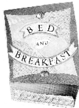
Illustration by Krysten Brooker.